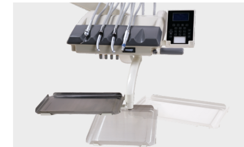
Tray can be rotated 360°.