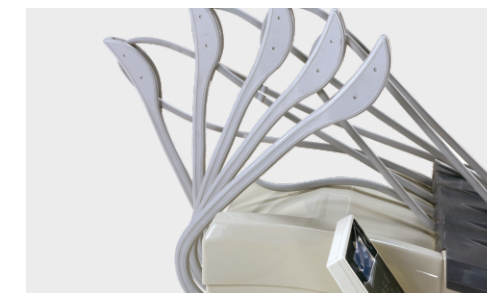
up-mounted tool tray tray, the tubes with stepwise stretching and automatically reset function, no dragging feeling.