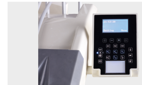
Easy and clear touch panel, with three memories, with time and operation data.