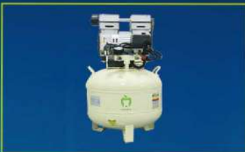
1 drive 1 compressor

Compatible Brand: EMS Handpiece: HP-5L(with LED lamp, Detachable) Function: G, P Potentiometer: Carbon-film potentiometer (circular) Size (mm): 75*56*34mm Weight of main unit: 0.125kg Power input: 24VAC 50Hz/60Hz1.3A Fuse of main unit: T1.6AL 250V Primary tip vibration excursion: <200µm Tip vibration frequency: 28kHz±3kHz Output power of tip: 3W-20W Half-excursion force: 0.5N-5N Water entrance pressure: 0.01-0.5MPa