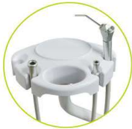
Aluminum Strong and weak suction

Illuminance degree 8000– 20000LUX Color temperature 4500 –5000K – Yellow :3000K Light spot size 80X160mm ( distance:700mm ) Control Method: Induction Switch, Manual Control