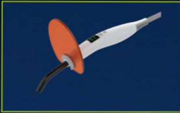
Appledental curing light