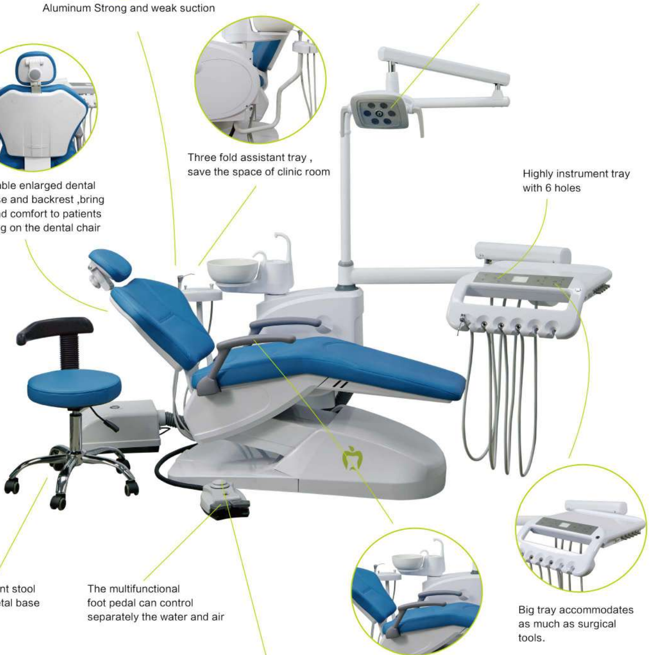
Highly instrument tray with 6 holes