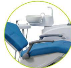
Adjustable armrests to meet operational needs