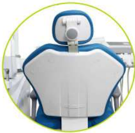
Comfortable enlarged dental chair base and backrest ,bring safety and comfort to patients while lying on the dental chair

Illuminance degree 8000– 20000LUX Color temperature 4500 –5000K – Yellow :3000K Light spot size 80X160mm ( distance:700mm ) Control Method: Induction Switch, Manual Control