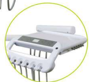
Big tray accommodates as much as surgical tools.