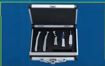
2pcs A1+1set low speed (CA+SH+AM)

Gross Weight: 6.0kg Monitor: 38*37*2cm LCD Clamp: 34*27*2cm Unit Package Size: 571cm*41.9cm*11.8cm Focal length: 3mm-50mm, Auto focus Features: 1. Multifunctional-Can take 1&4 pictures 2. Clearer-High resolution SONY CCD 12 mega pixel 3. Durable quality- HUA WEI Hisilicon chips 4. Easy connections-Fast-plug connectors 5. 8G storage-In USB disk 6. HDMI+USB interface; 7. 6-LEDS(with glass cover) 8. Wifi connection