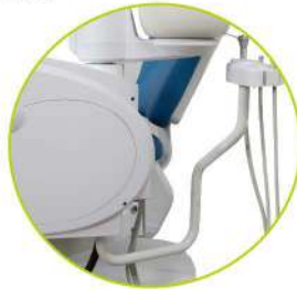
Three fold assistant tray , save the space of clinic room