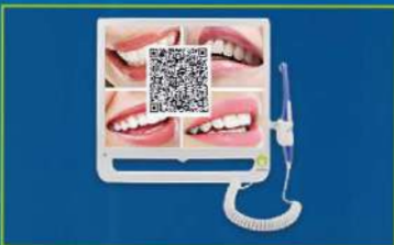
WIFI Intra oral camera

Gross Weight: 6.0kg Monitor: 38*37*2cm LCD Clamp: 34*27*2cm Unit Package Size: 571cm*41.9cm*11.8cm Focal length: 3mm-50mm, Auto focus Features: 1. Multifunctional-Can take 1&4 pictures 2. Clearer-High resolution SONY CCD 12 mega pixel 3. Durable quality- HUA WEI Hisilicon chips 4. Easy connections-Fast-plug connectors 5. 8G storage-In USB disk 6. HDMI+USB interface; 7. 6-LEDS(with glass cover) 8. Wifi connection